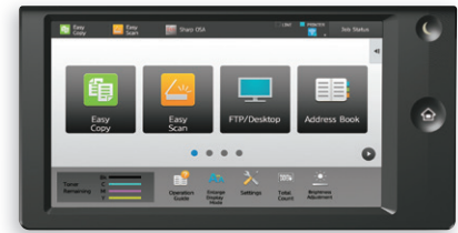
Sharp's customizable touchscreen display offers a user-friendly graphical interface, and is common across nearly 30 models.