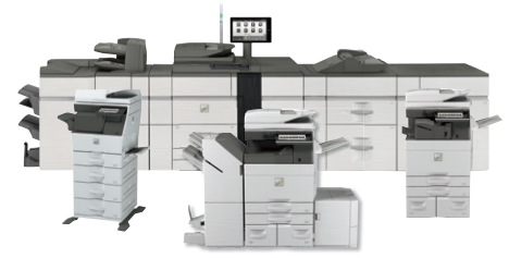
Sharp offers a range of multifunction document systems to accommodate any size educational environment.